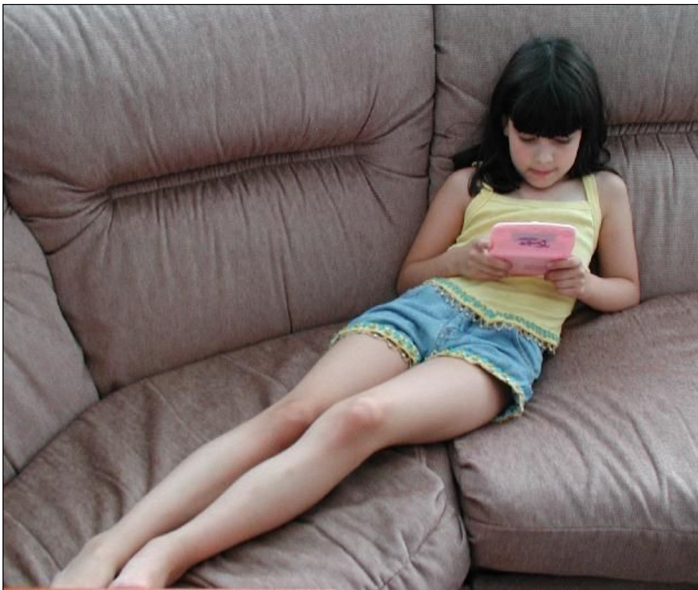
Above: Material witness